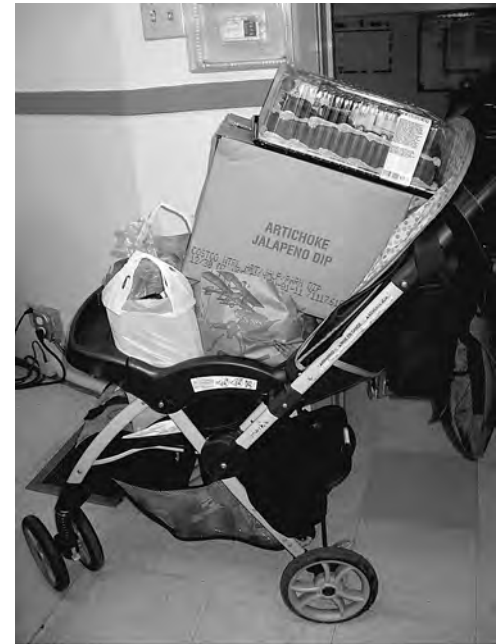
Family taking a bus gets food in baby stroller, including a birthday cake

Ruth at the check-out desk said, "People just don't realize how bad off these neighbors of ours are. They cannot get jobs, they have kids to feed and the amount of help we at Fish can give them won't last long." That is why we need your help: to give a helping hand and some food.