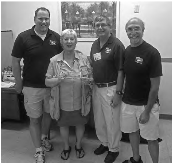
BMW Club presents Gloria with a generous check for Fish's program