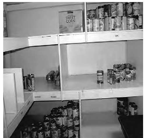
Some food shelves at Fish are bare