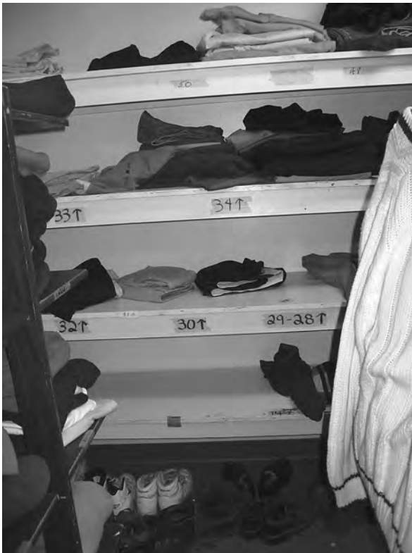
Men's clothing is sparse and needs to be supplemented with pants (jeans, Dockers), shirts, sweaters, shoes, sox, underwear