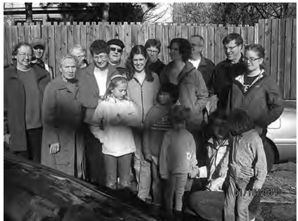
Portland Mennonite workers did many jobs

Please give us your e-mail address so that we may send the Newsletter to you and save postage and paper.